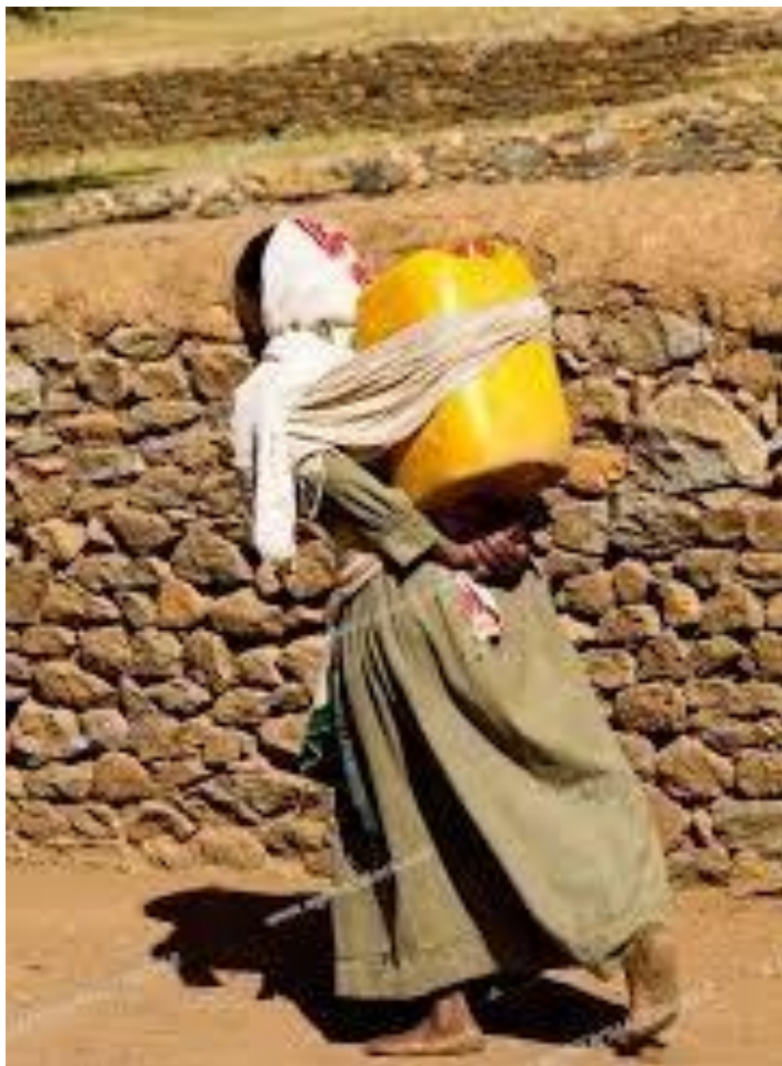
Figure 1- women carrying standard 25 litter jerry can