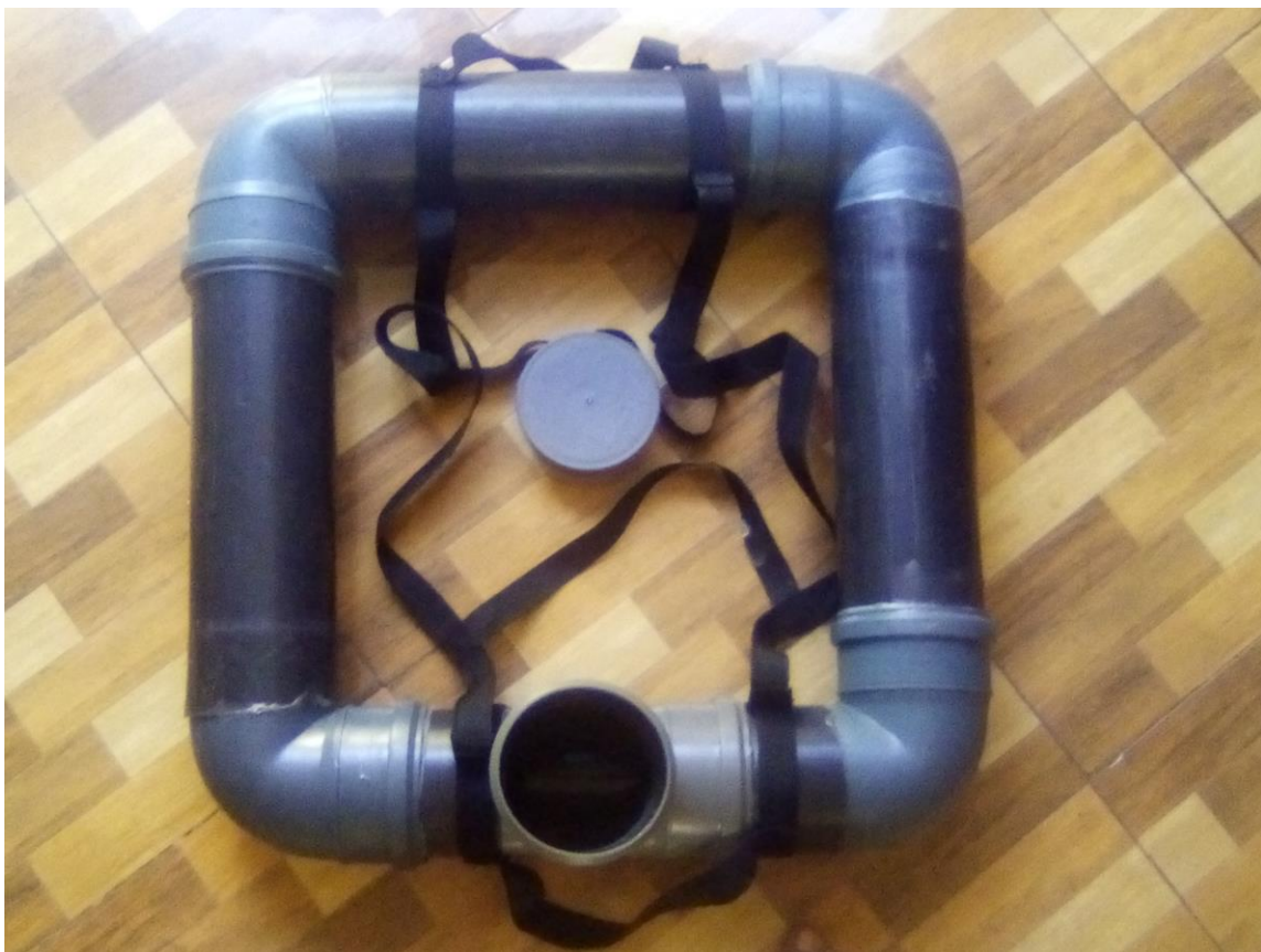
Figure 3 - Anteneh's Jerry Can

In the first prototyping phase PVC is used to construct the Anteneh's Jerry Can because it is easily accessible and cost effective but PVC can become brittle and crack when placed in a few scenarios for prolonged periods of time like Ultraviolet Light Exposure, cold temperature, age and chemical exposure. This can be avoided by using other materials like Polypropylene. In this case there will not be any fittings and no glue will be used.