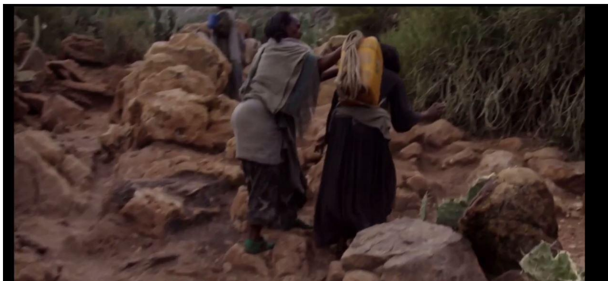
Figure 2 - women carrying standard 25 litter jerry can