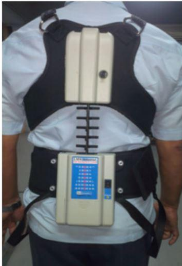
Figure 10 – iLMM fixed on the back of a subject.

There have been many studies concerning effect of head load, hand load, single side shoulder loads on the spinal chord and lower back disorder. In the study of impact of load carriage on lumbar spine mobility among Indian workers during load carriage there has been found alterations in posture, gait, trunk and spine activity, which could be linked to lower back problem as seen in the following pictures.