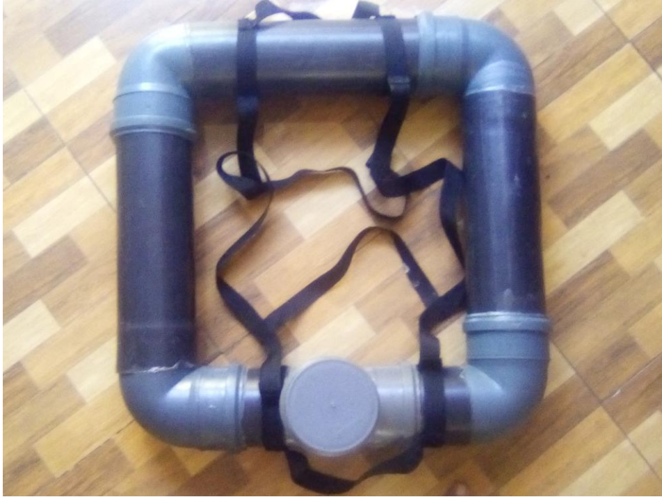
Figure 4 - Anteneh's Jerry Can