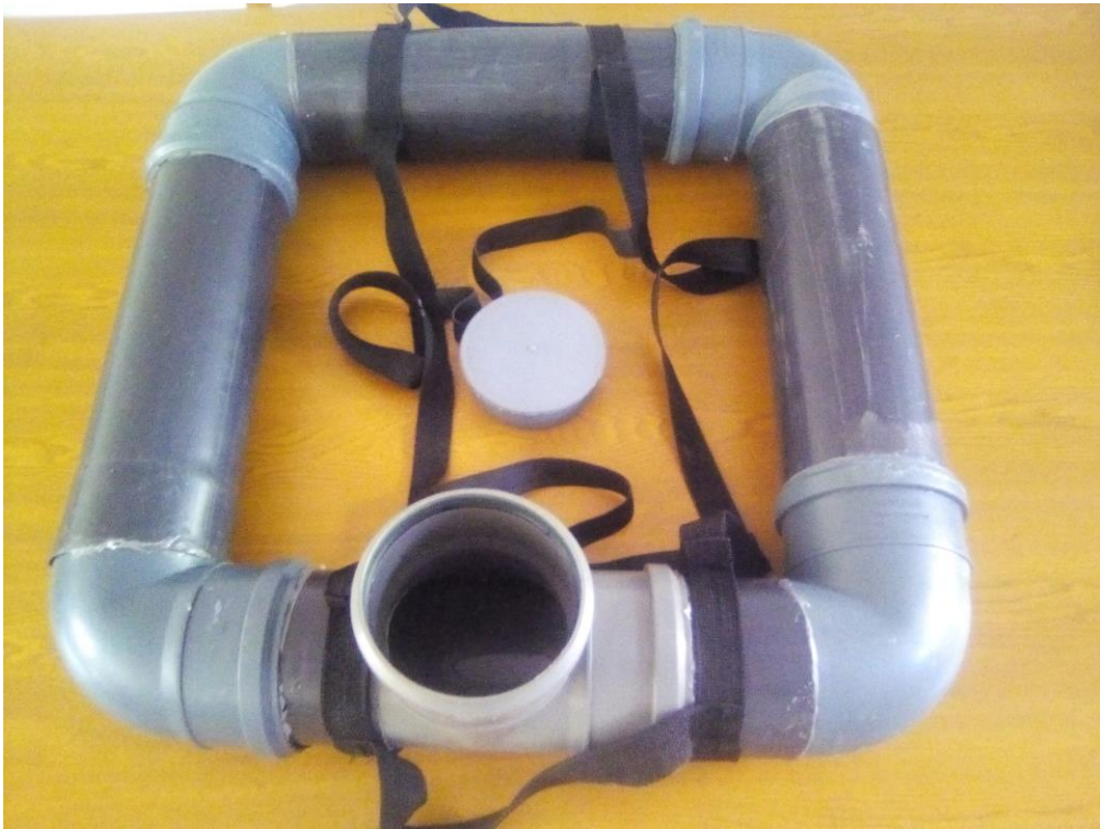
Figure 5 - Anteneh's Jerry Can